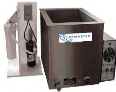
Bench-Top Ultrasonic with Filtration System /Outer Amp