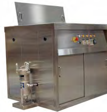
Floor Standing System with Cover and Filtration