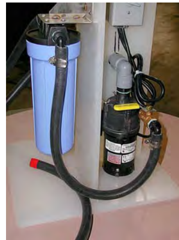
Integrated Cartridge Filtration System